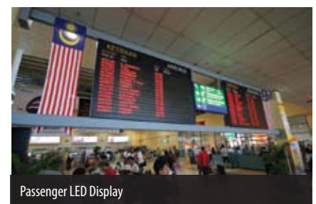
Passenger LED Display

It is a suite of modular applications for train scheduling 'Passenger Information Display System' with much more functionality.