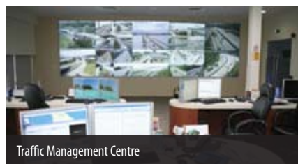
Traffic Management Centre

TrafficView® is a modular Commercial off the Shelf with a presentation layer for the Road Traffic Control Management Centre. It allows the Traffic Management Centre to view the road and traffic condition on GIS map.